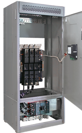
ASCO SERIES 300 SE Rated 800 amperes Type 1 enclosure