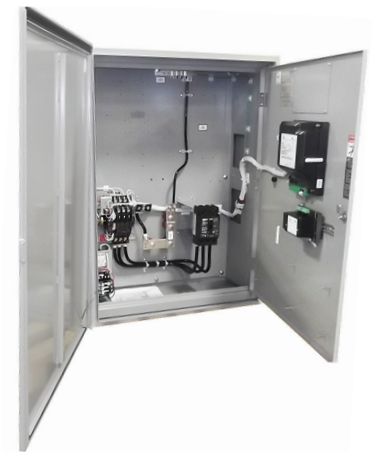
ASCO SERIES 300 SE Rated 200 amperes in Type 3R enclosure

ASCO SERIES 300SE products use two types of construction.